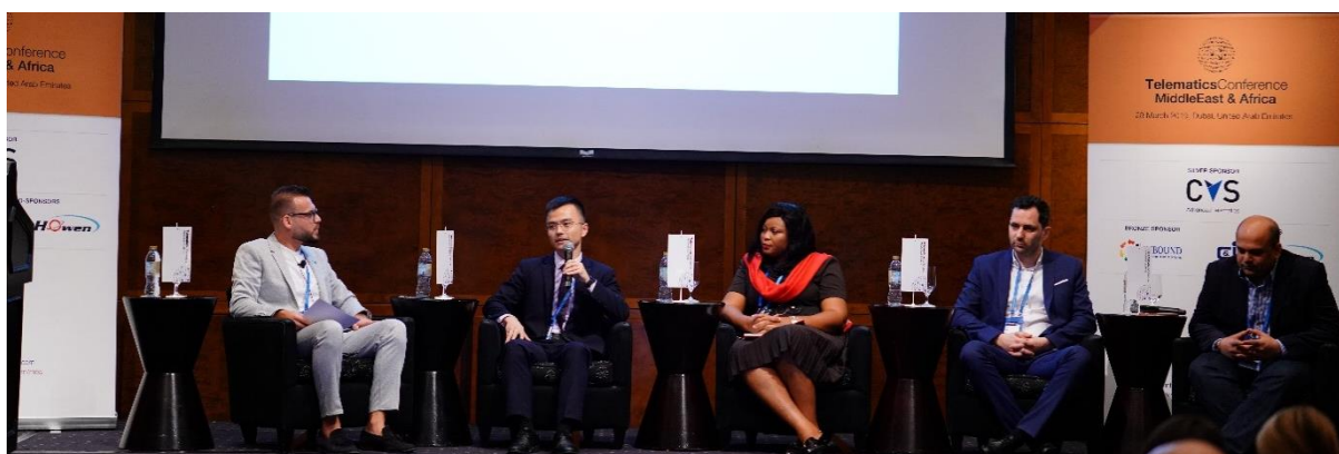
Panel discussion on The Increasing Need for Advanced Telematics