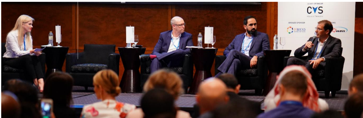
Panel discussion on The Great Impact of New Technologies