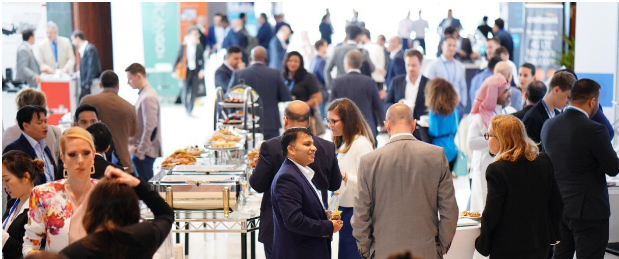
After event networking dinner in the exhibition area

The event concluded with a networking dinner in the exhibition area, which gave delegates one more opportunity for one-on-one meetings and networking, and where exhibitors had the final chance to showcase their solutions to the telematics audience.